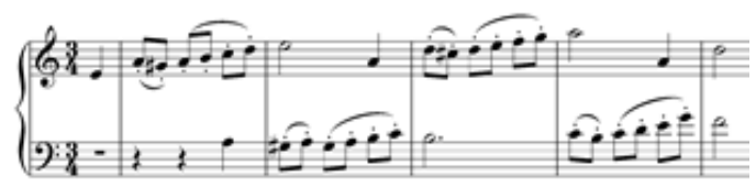
Placement of ideas in a different chord