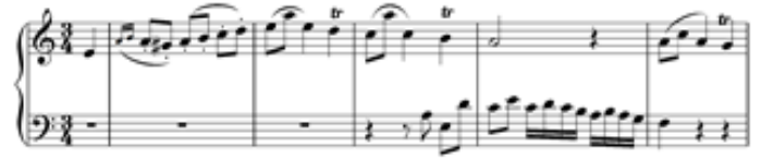
Adding a fill at the end of a phrase