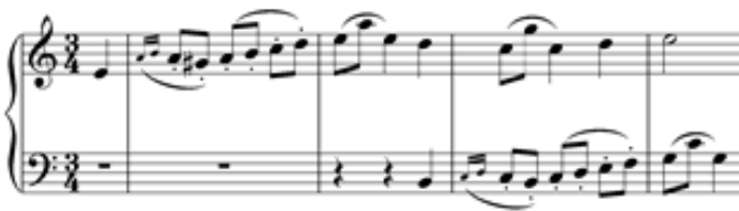
Repetition of ideas at a different pitch